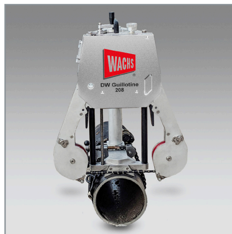
DWG saws mount securely to workpiece for safety

They feature one of the lowest costs per cut in the industry due to the longevity of the diamond cutting wire, and a lower total cost (the initial purchase combined with consumable costs) over the life of the saw. Lowest cost per cut, safer to use, and fast cutting – that's high tech pipe cutting!