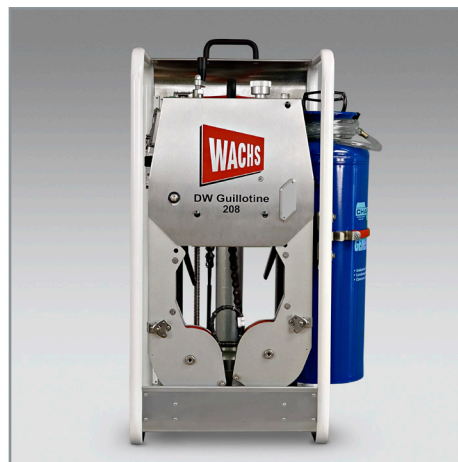
Arms collapse for compact storage. Optional wheeled carrier shown.